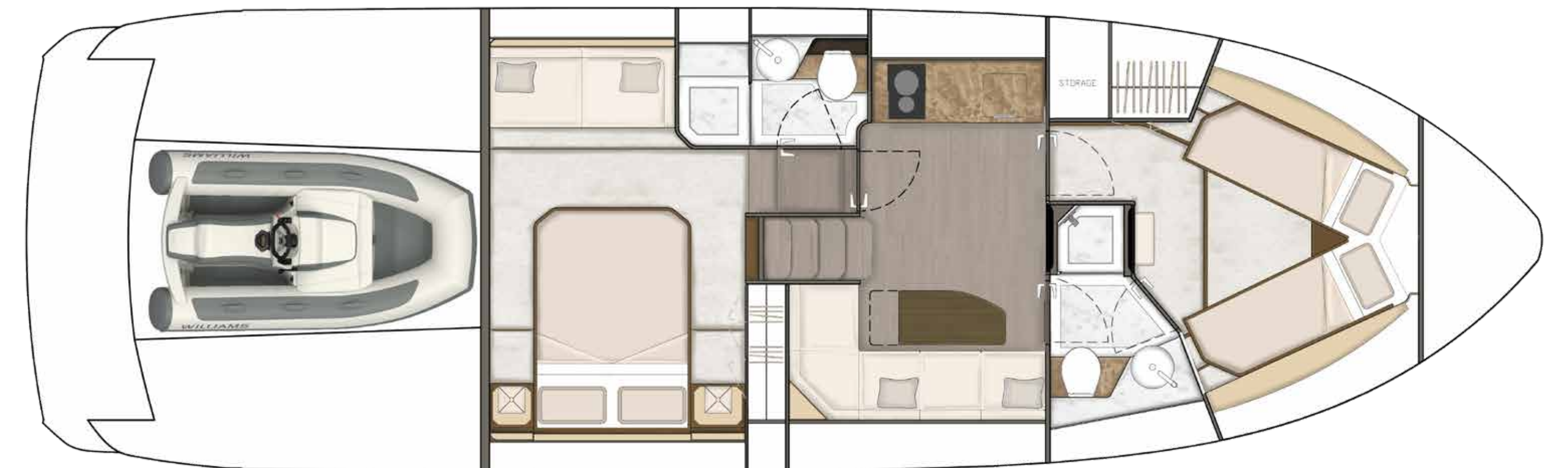
FORWARD SCISSOR BERTH