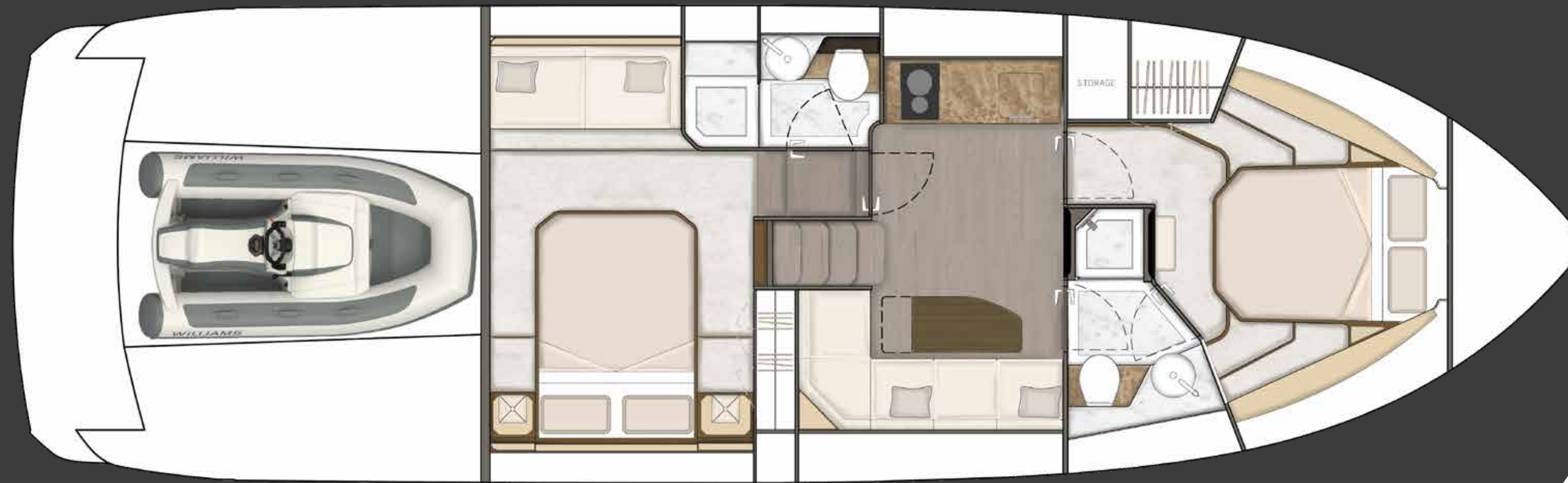
MID MASTER CABIN