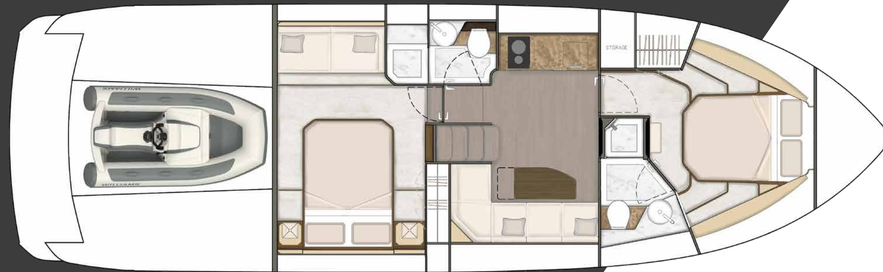
FORWARD MASTER CABIN