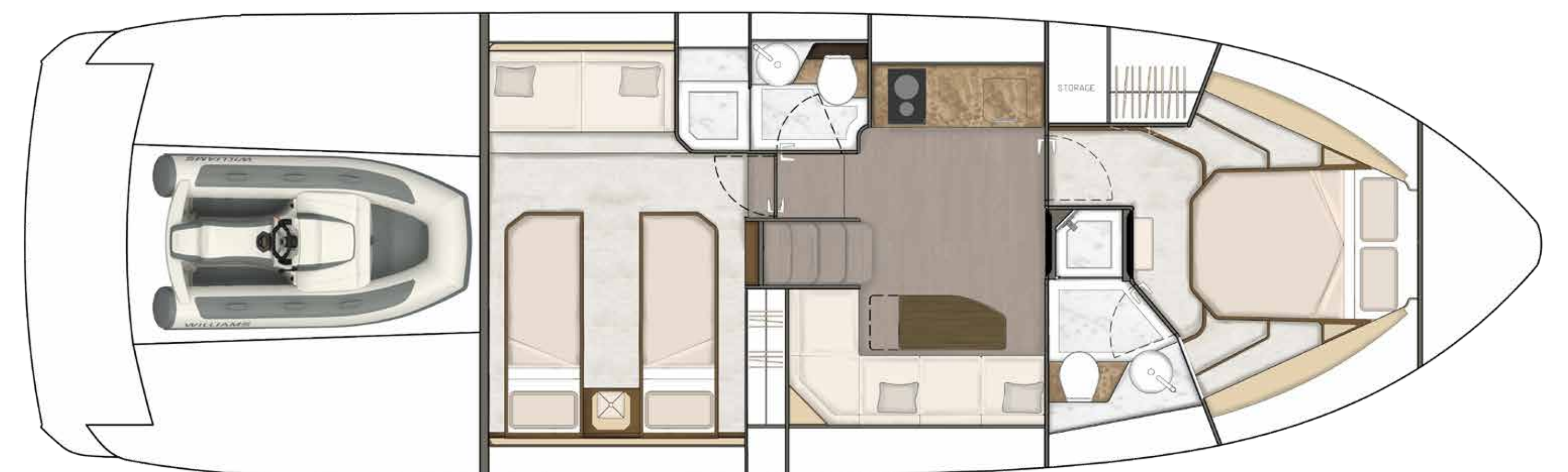
MID CABIN TWIN